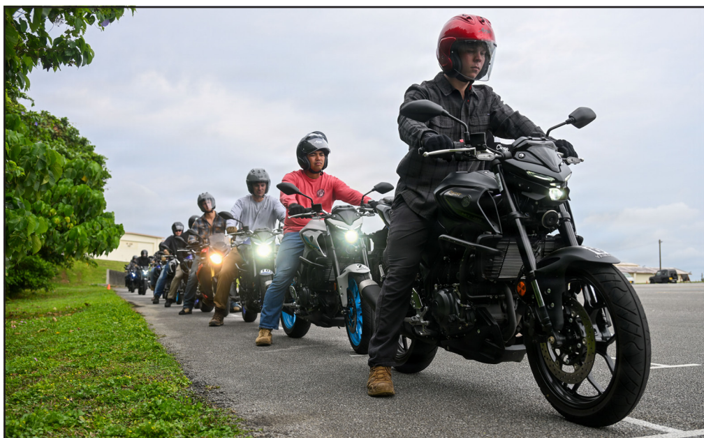
U.S. Marines with 3d Reconnaissance Battalion, prepare for the next iteration during the Basic Riders Course on Kadena Air Base, Okinawa, Japan, March 31, 2026. Basic Riders Course prepared the Marines in all things safe motorcycle handling to include starting and stopping drills, how to change gears, turning, and how to drive in different scenarios.